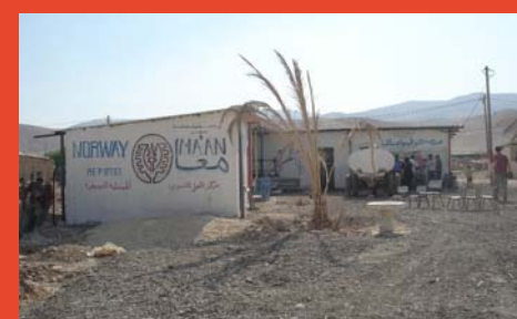
Elementary school in Fassayel Al Fouqa