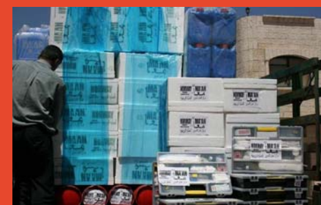
In-kind assistance for Bedouins

Last year, "NRO" supported MA'AN in another project in the Jordan Valley including constructing a school in Fasayel Al-Fawqa village, and providing some Bedouin families through in-kind assistance.