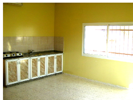
Renovated kitchen in a women center