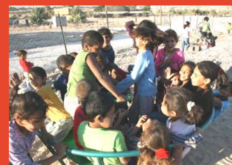
External games for the school

Since 2006, MA'AN has been implementing several projects funded by the Norwegian Representative Office "NRO" in support of the Bedouin families. The current "Supporting Bedouin Rights to Exist with Dignity" project aims at providing Bedouins with the necessary resources and tools to secure their existence in the face of the Israeli expulsion policies. The main activities of the project include renovation of houses