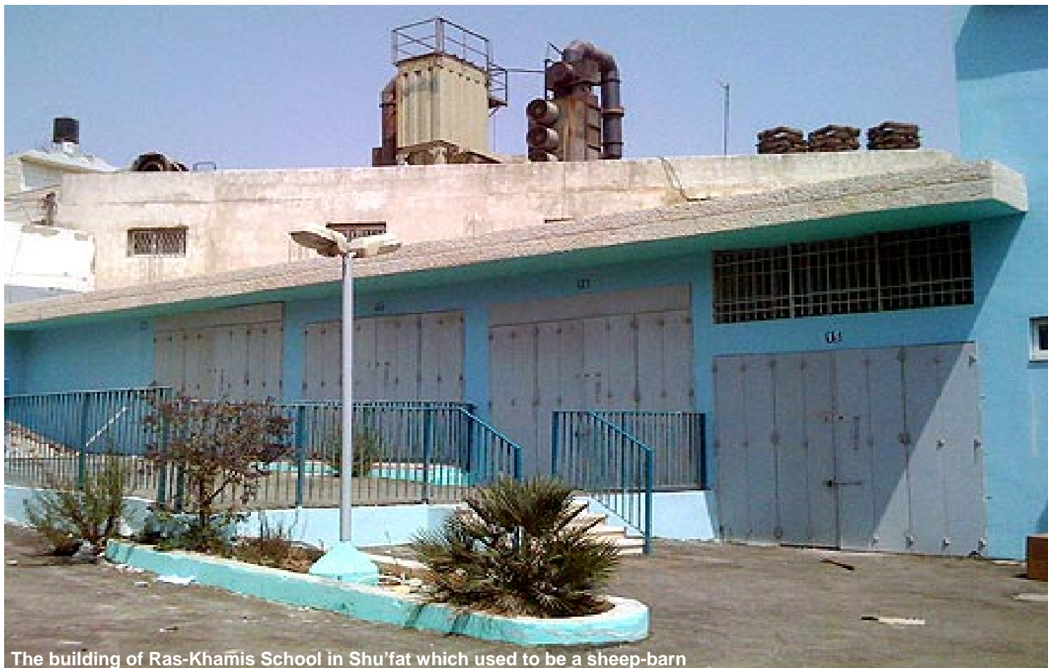
The building of Ras-Khamis School in Shu'fat which used to be a sheep-barn

Palestinian students from Shu'fat in East Jerusalem, studying at Ras Khamis School, are exposed to grave health and environmental risks on a daily basis. Eight hundred Palestinian students, age 5-12 years, study at the school, and the school's environment is not conducive nor does it meet universal education standards. The school is located in an industrial zone in a building that is next to a mining factory. The school's building used to be a sheep barn and was turned into a school by Jerusalem Municipality. Students and teachers suffer