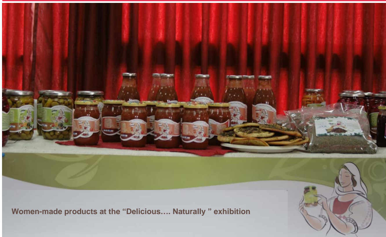
Women-made products at the “Delicious.... Naturally ” exhibition