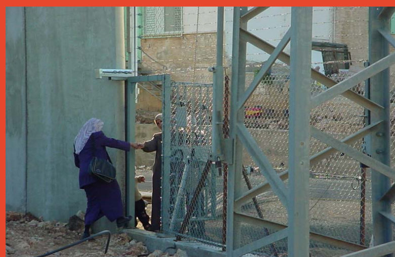
Family living between the Wall and the Green Line in Haris village in Salfit district

International Court of Justice's (ICJ) advisory decision on the Apartheid Wall from an international law perspective. NAR is funded by COR-DAID and it aims at consolidating and assisting the popular committees against the Apartheid Wall efforts in resisting the Wall.