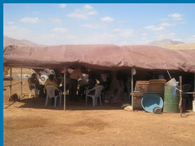
Abu Saqr family's tent

Any response to displacement will need to adopt a comprehensive approach that should include, but not be limited to legal support, international advocacy, securing of donor funding to support services provision and solidarity visits.