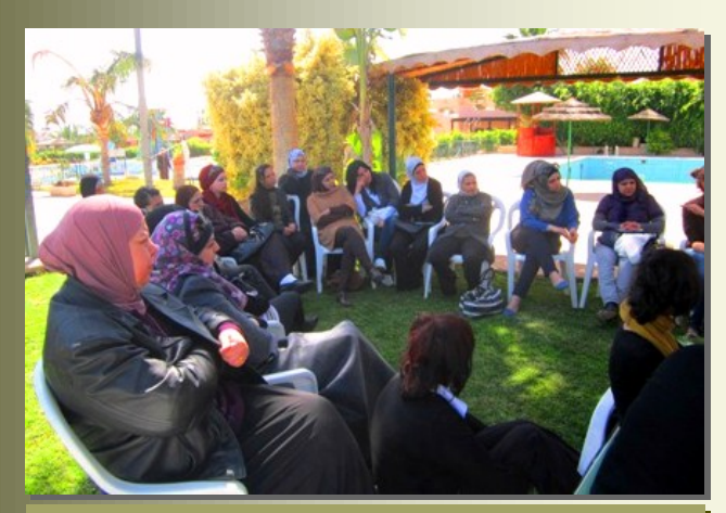
BADIL mark International Women's Day in the West Bank and Gaza.