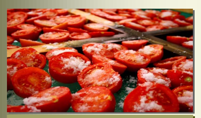
Beautiful agricultural produce of the Beit Duqqo Development Society.