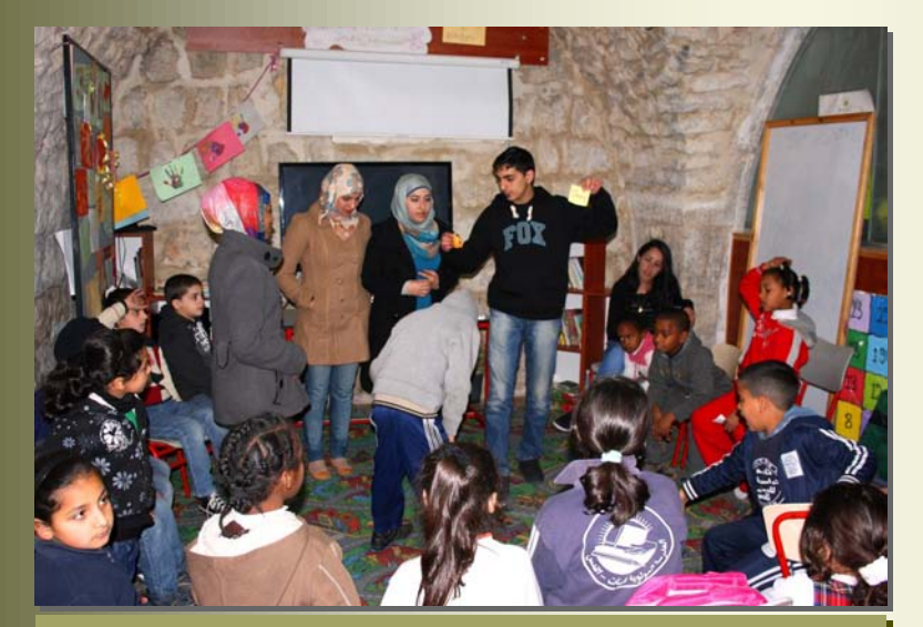
Educational classes at Sharek Youth Forum's Enrichment Center in Jerusalem's Old City.