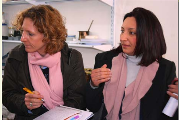
PNGO IV mid-term review team talk to Beit Duqqo's beneficiaries