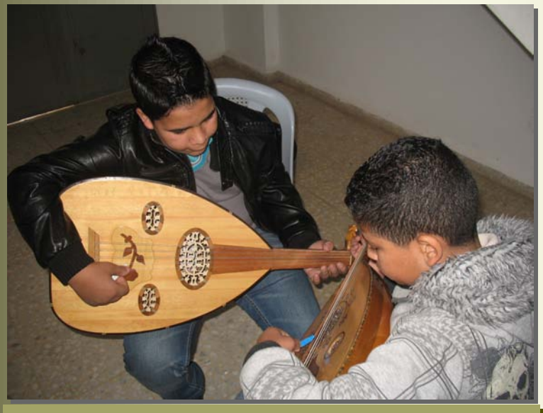
Two young musicians from the Edward Said National Conservatory of Music