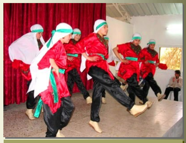
Dabke classes at Beit Ula Cultural Center