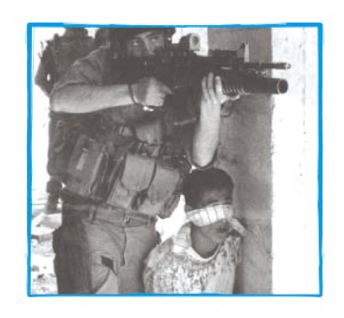
Chapter 2 The Right to Liberty