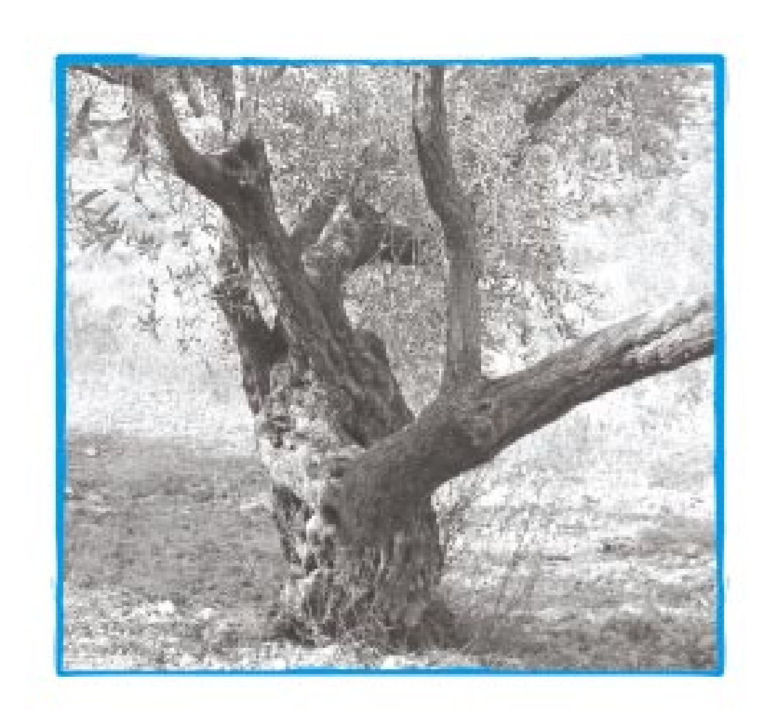
Chapter 3 Right to an Adequate Standard of Living